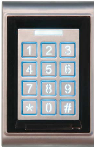
Part No: 2920-5001