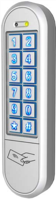
Part No: 2920-5000