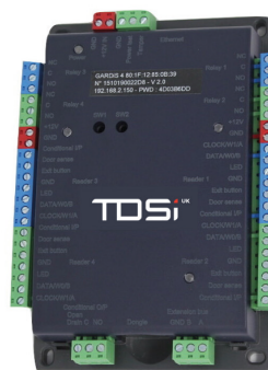
Figure 2: 4 Door Controller