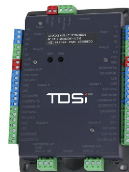
Figure 2: 4 Door Controller