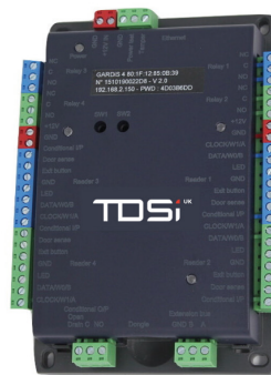
Figure 1: 4 Door Controller